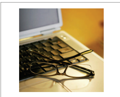
Patriot Academy Online

If you have any questions regarding the Patriot Academy and would like to discuss how the district can support your educational goals, please contact the Central Office at 485-1021.