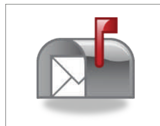
Email list available.

ing address to umche-homeschool@charter.net . Your address will be deleted if the email is returned, so if you thought